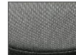
Black Elegance Pattern (not available on round spas)