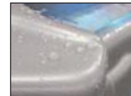
Contact Chamber Ozone Injection Sanitizer

* Please consult your dealer on when these options are standard with a particular spa.