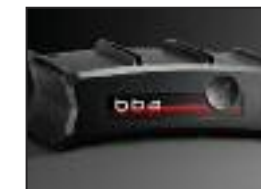
BBA Stereo for SpaTouch™ Controller