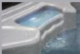
Cascading Water Feature