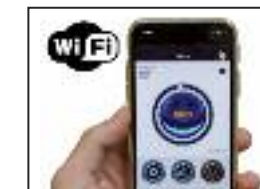
WiFi Module for SpaTouch™ Controller