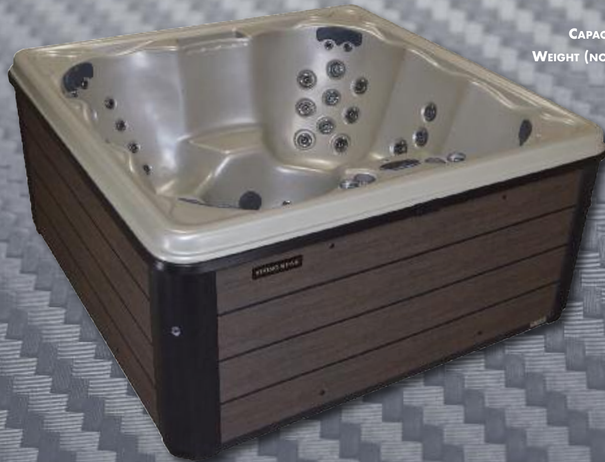
Legacy 2 shown