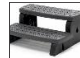
Walnut or Gray Step