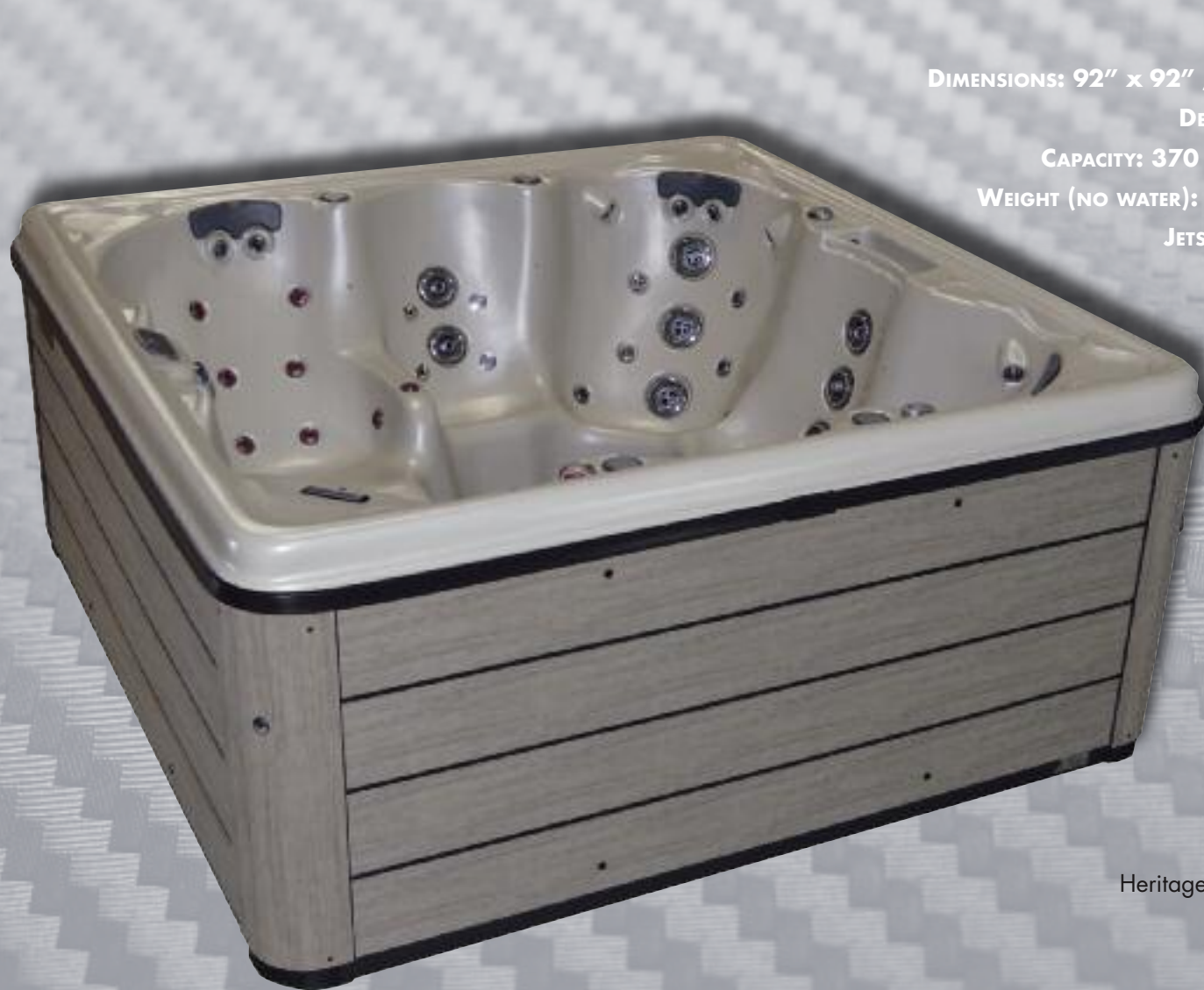
Heritage 2 shown