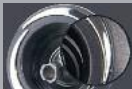
Stainless Steel Jets