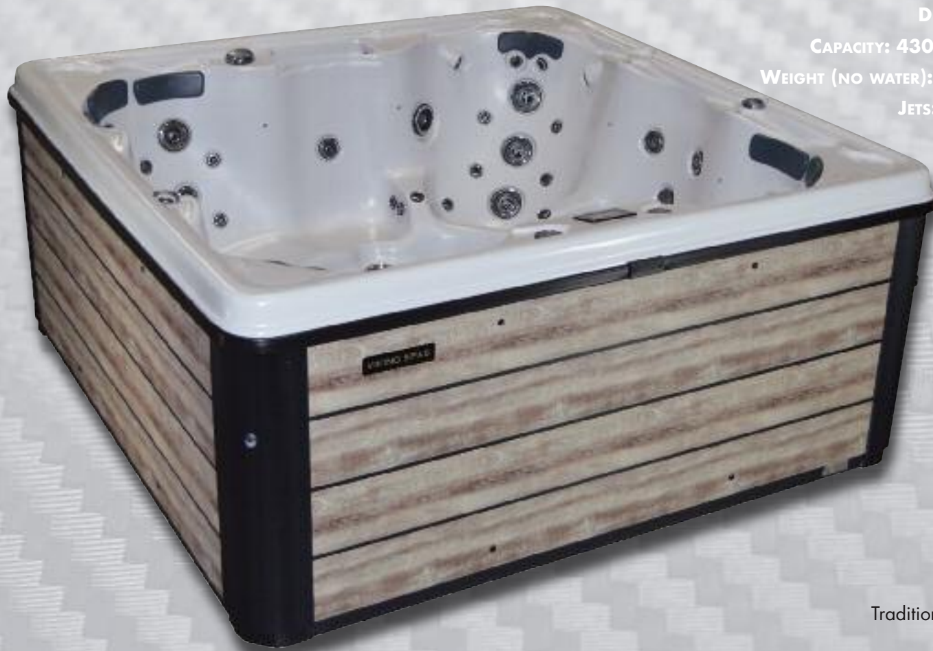
Tradition 2 shown