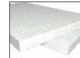
Foam Board Insulation