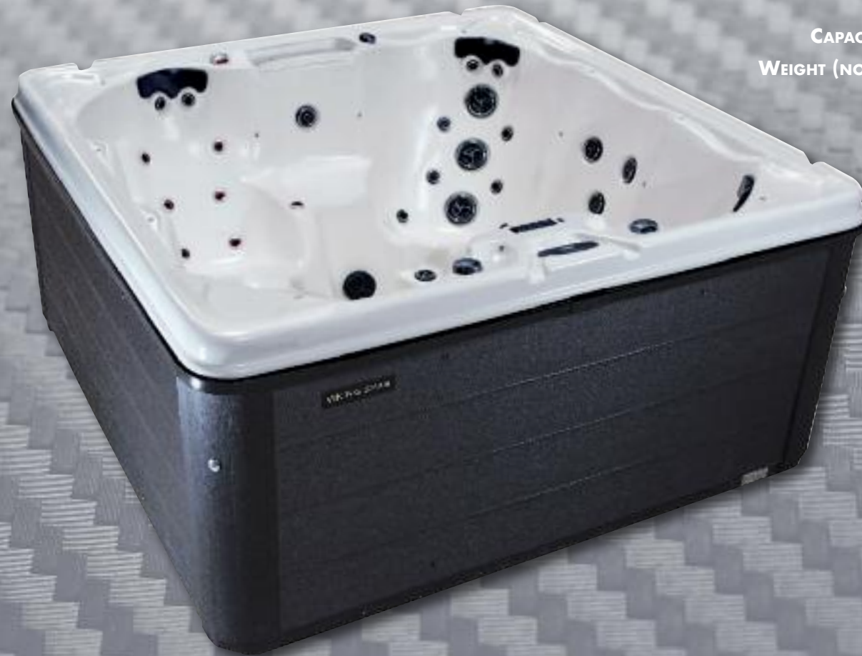
Legend 2 shown